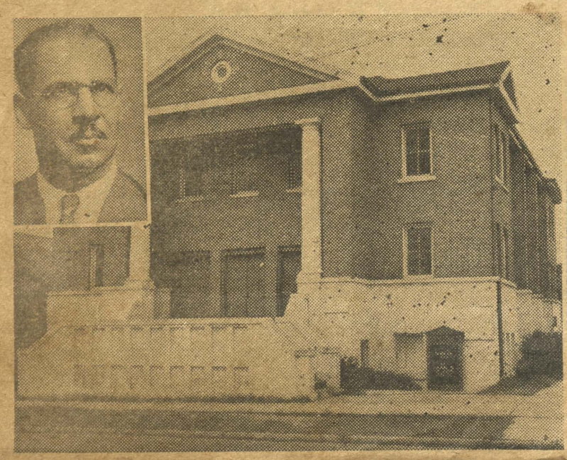
MOUNT OLIVE BAPTIST CHURCH